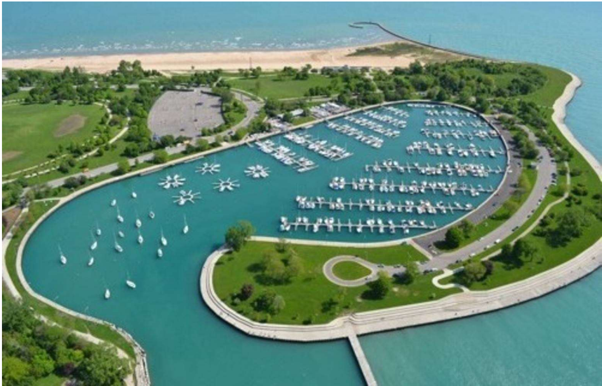
Montrose Harbor Chicago