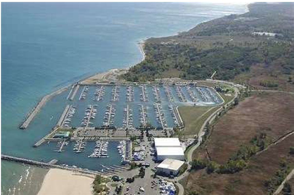
North Point Harbor