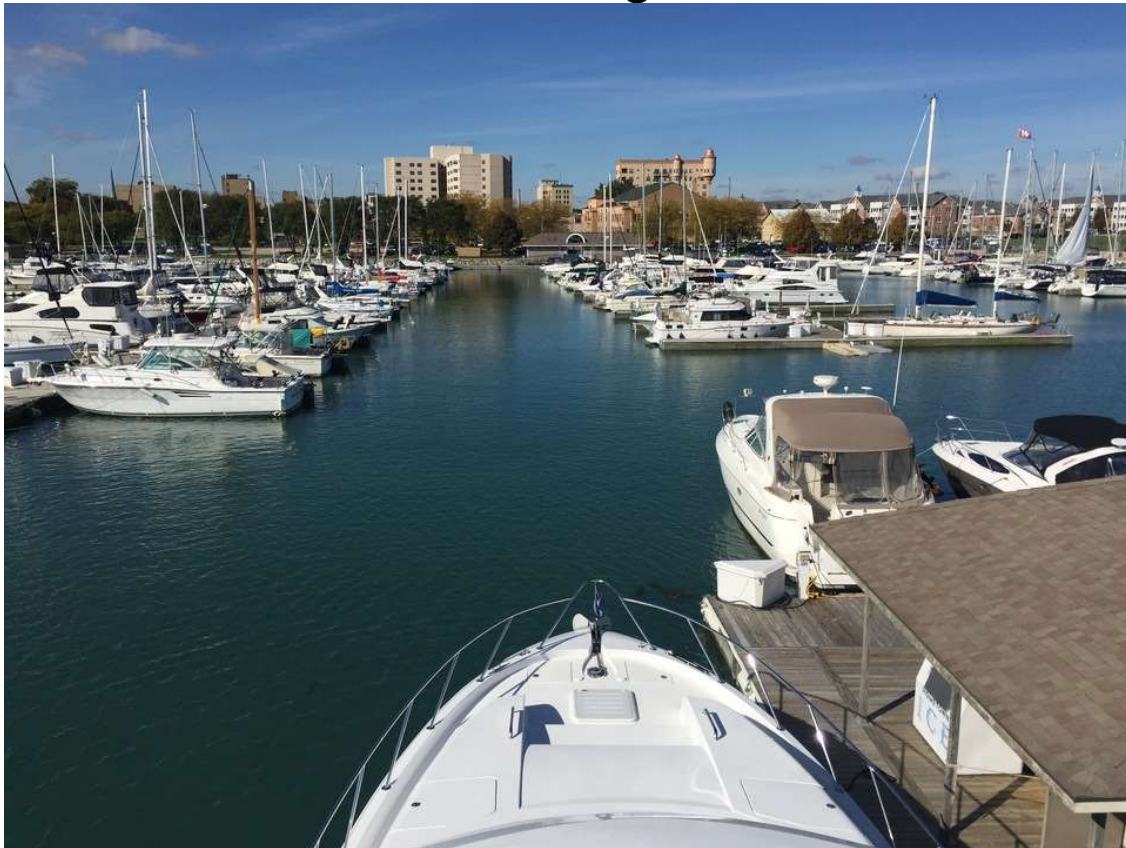
Southport Marina Kenosha