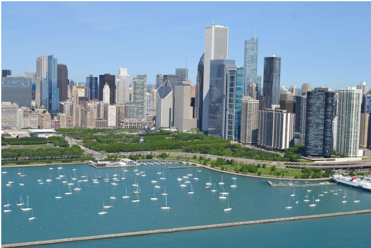
Monroe Harbor Chicago