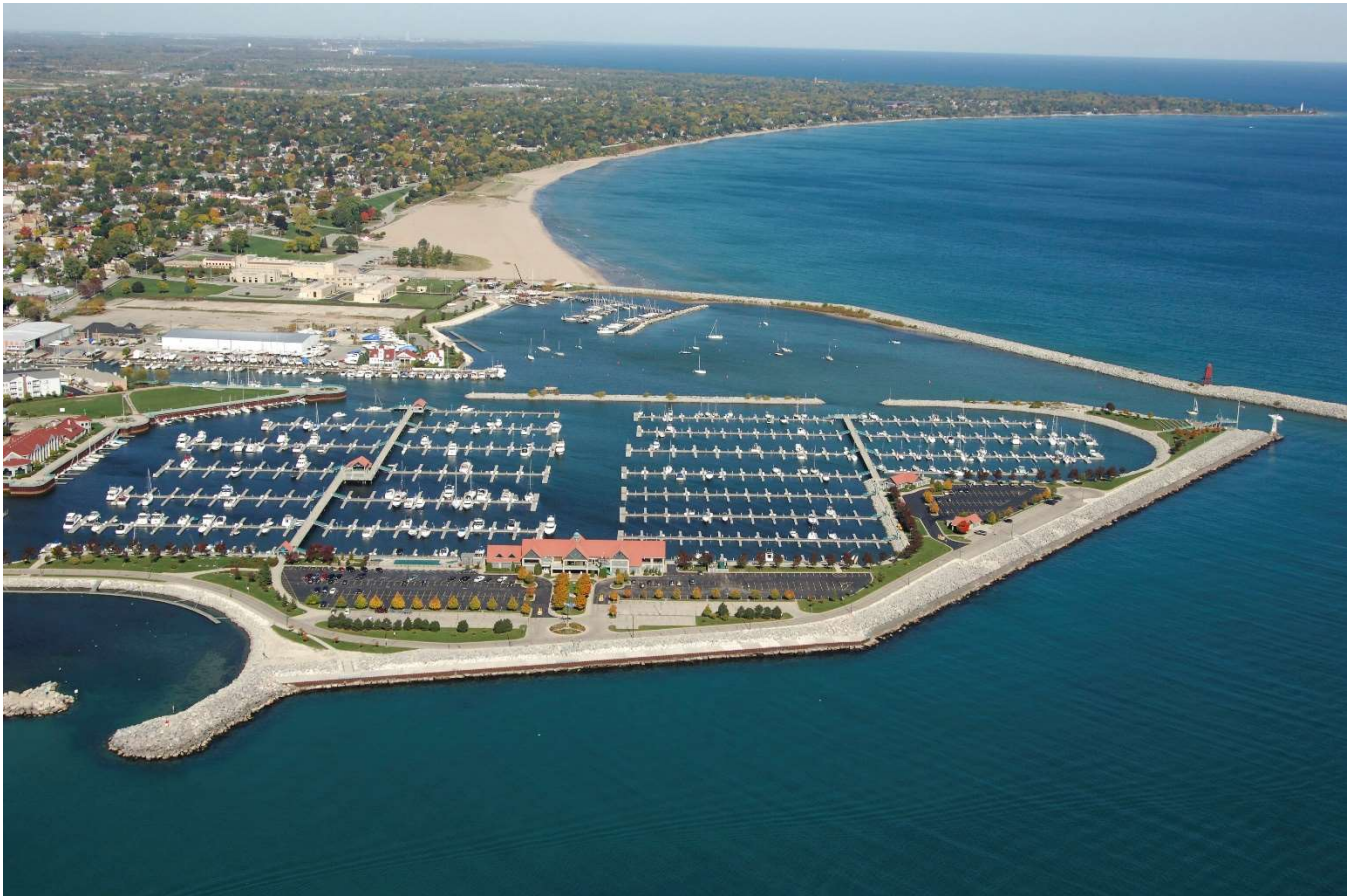
Reef Point Marina Racine